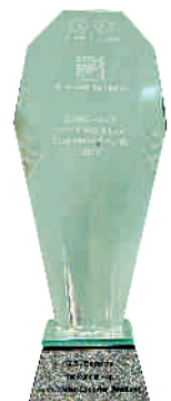
ECGC- Dunn & Bradstreet