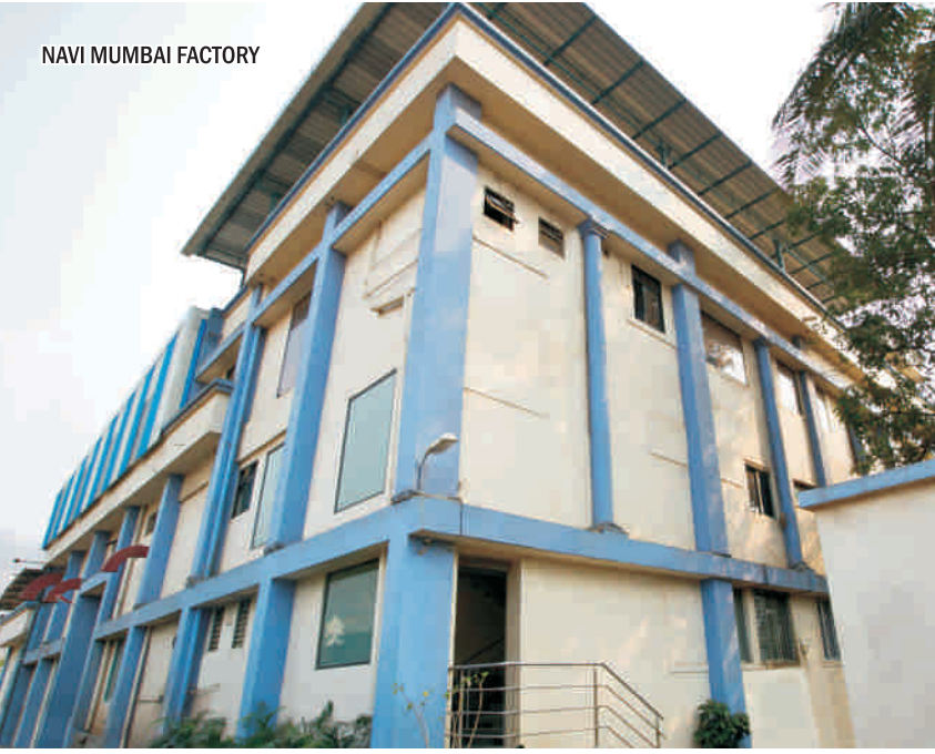
NAVI MUMBAI FACTORY