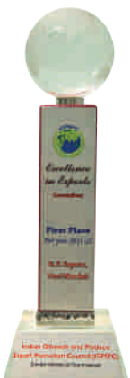
IOPEPC Award (An EPC)

CNBC TV18 International Trade Awards - Nominated for the Awards for year 2006-07