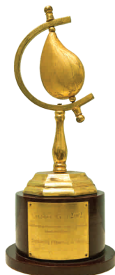
GLOBOIL Gold Trophy